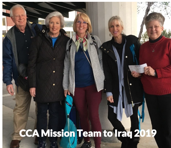
CCA Mission Team to Iraq 2019

CCA does not exist for its own self-perpetuation, but for God's mission, in the local neighborhood, city, region, and throughout the world. Though we are not a neighborhood church, we see ourselves as a church for the neighborhood. The Whitefield Center, our urban ministry house, has the Mission of raising the educational level and quality of life in the geographic "heart" of Savannah – The Thomas Square Neighborhood. Whitefield seeks character transformation "one life at a time," by implementing virtues and character building through all its initiatives. These include High School Diploma Recovery through an on-site Academy; daily after-school mentoring and tutoring through Urban Hope ; Adult Basic Literacy instruction; Financial Literacy instruction in neighborhood schools; Resident Advocacy and Bible Instruction in a local senior home facility for lower incomes; and functioning as a home for five local partners who serve inner city youth. In addition, we offer twice-monthly lunches to the homeless at The Lunch Place, where we transform our parish hall into a joyous place of hospitality and hope.