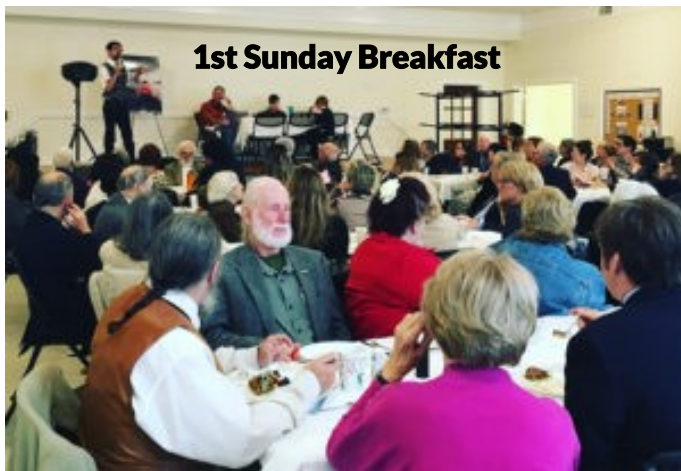
1st Sunday Breakfast

We believe the Christian life is most fully experienced in community, or “Life Together,” encouraging our parish family to love one another while building a supportive community for all people in every stage of life.