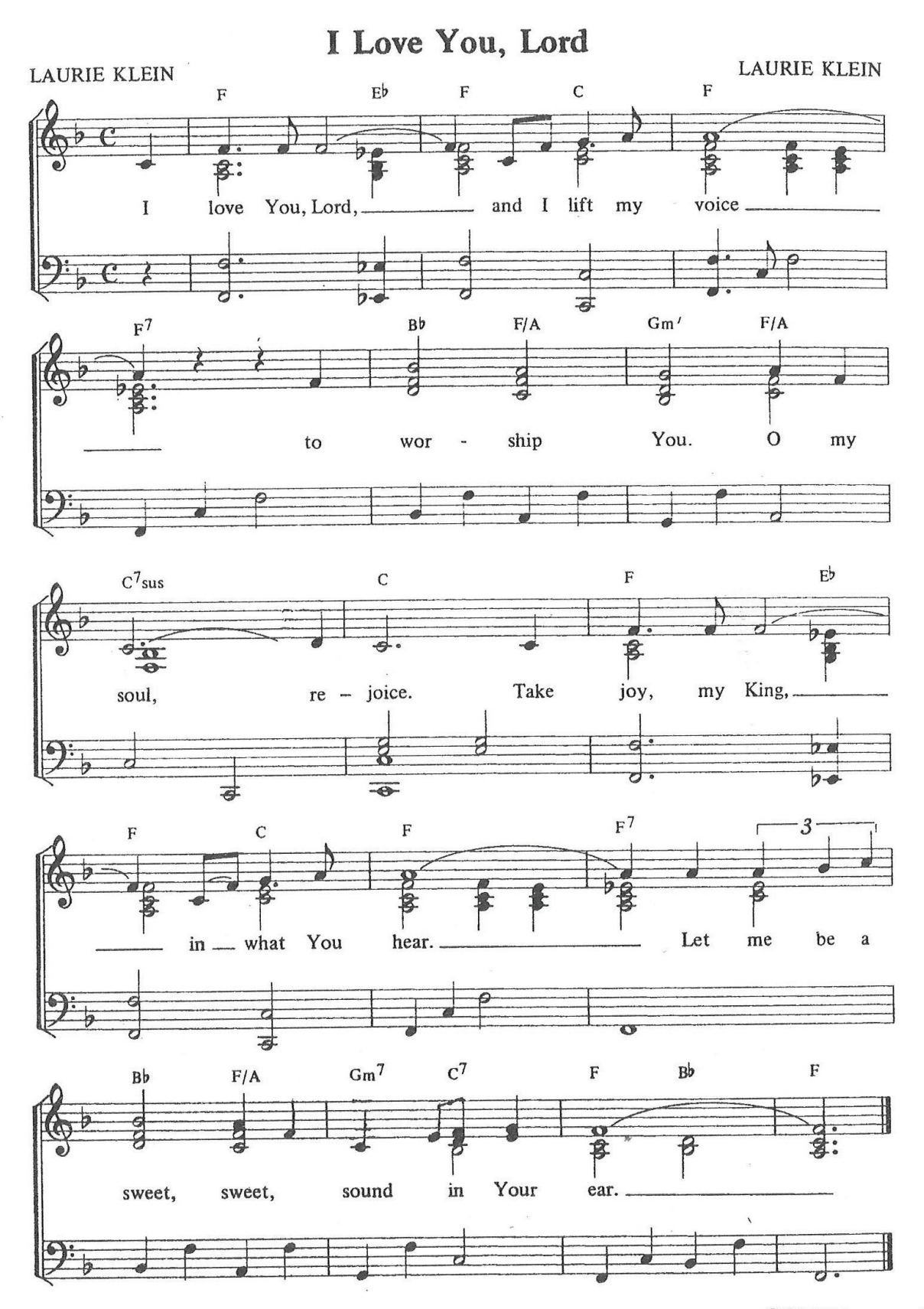
Copyright © 1978, 1980 Word Music (UK), Northbridge Road, Berkhamsted, Herts. All rights reserved. CCLI License #889